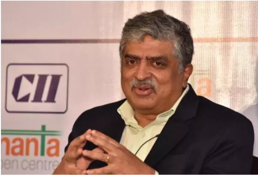
Chairman EkStep and Former Chairman Unique Identification Authority of India Nandan Nilekani at the 6th C K Prahalad Memorial Lecture on

Bengaluru, DH News Service Nov 21 2017, 0:53 IST