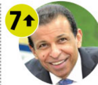
Mukesh Ambani ■ 345