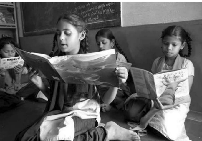
School children in Bangalore reading Pratham books in libraries set up by the Akshara Foundation in government schools.

In spite of all this, higher education in Africa has been neglected. In the 1980s and 1990s, African universities suffered neglect due to difficult political and economic times, increasing debt, forced reductions