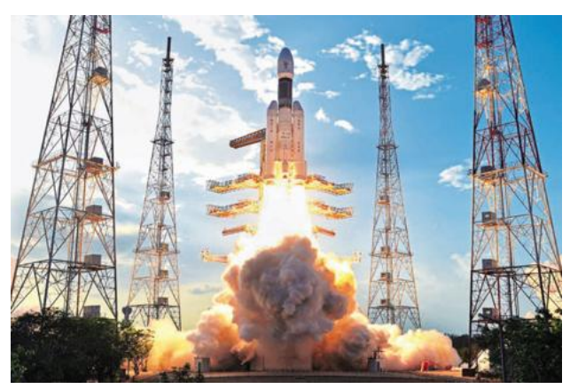
India's space business is ready for lift-off