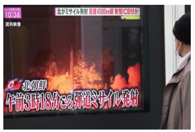
North Korea's ICBM launch 'grave threat' to 'entire world': Trump, Moon