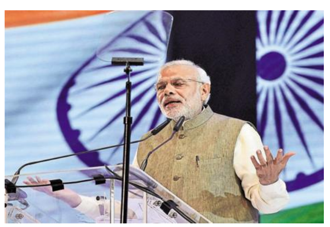
Narendra Modi government is getting one big reform right