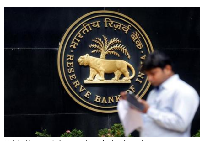
RBI's bad loan resolution move throws bankers into a tizzy