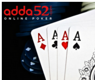
Win more than your monthly salary! Signup to Play Poker Adda52