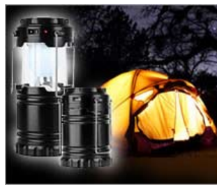
Solar Lantern Must For Your Next Trip. Rediff Shopping