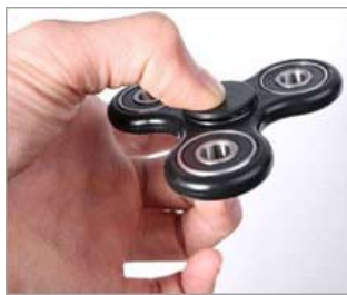
8 Innovative Products That Make Life Simpler. Rediff Shopping