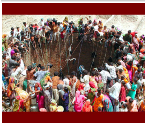
Thirsty earth: Indian villagers in Gujarat gather to draw water from a well

BANGALORE: By July this year, the monsoon has established itself vigorously over much of the subcontinent. The anxieties of the long, intense summer months, when nations hold their collective breath in anticipation of the cooling, life-giving rain, have receded. But the region's 1.6 billion people know that next summer, the worries will return.